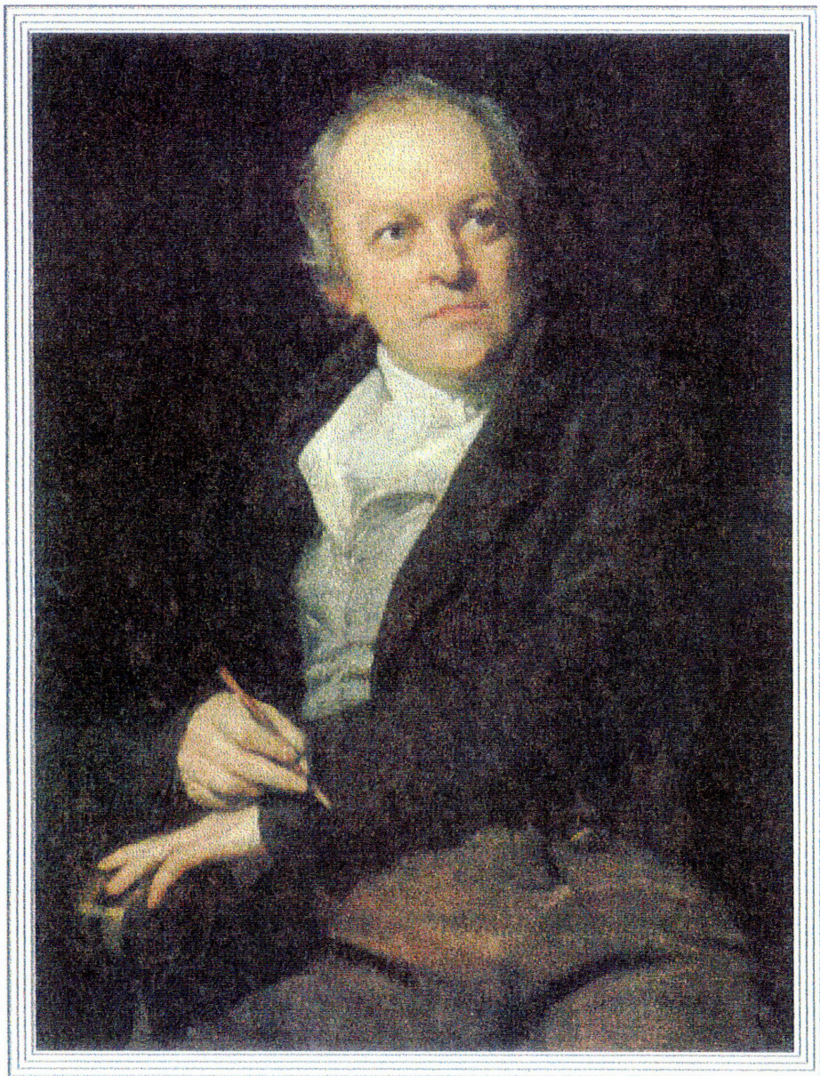
William Blake 1757-1827

I must Create a System, or be enslav'd by another Mans I will not Reason & Compare: my business is to Create"